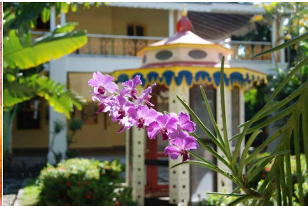
3rd Place Winner - Sandy Dolan, Courtyard Orchid , Photography