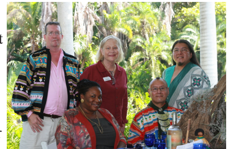
Guests enjoy Entirely Entertaining XVII

For our final luncheon on May 7th, we return to Fort Lauderdale's landmark The Tower Club with good food, camaraderie, and breath-taking views of the city. At that time we will also have the installation of new officers. Mark your calendars...and thanks again for your valuable contribution of time and effort.