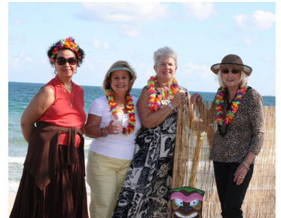
Alliance Luau Luncheon on Bonnet House Beach

Each of us will walk away with our individual memories... it is your work and your commitment that have helped ensure the legacy of Bonnet House will continue. Thanks to the Alliance it's a job well done!