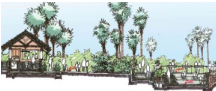
South Entrance Gatehouse Rendering

Bonnet House is keenly interested in what will happen to this section of the beach.