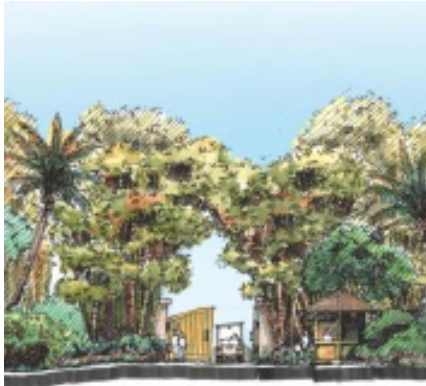
South Entrance Rendering

Recently, Patrick Shavloske and I attended a design competition sponsored by Tropic Magazine . Four architecture firms gave presentations on what they would recommend for revitalizing the North Beach area. North Beach runs from the southern end of the Bonnet House property to the W Hotel.