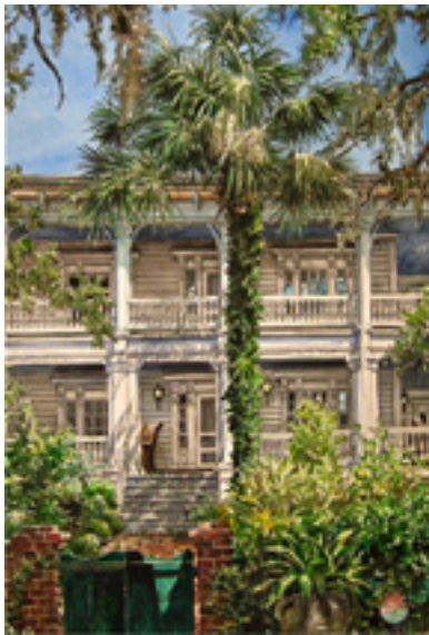
People's Choice Winner.