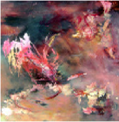
1st Place Winner.