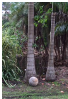
The runaway sphere!

Properly conserving and restoring both spheres is going to be an extremely costly endeavor. We have a quote from a reputable conservator for $10,871. We welcome anyone wanting to assist with funding this important project.