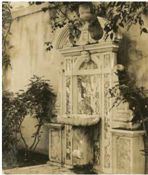
The fountain in Palm Beach

One of the features of the Bonnet House estate designed by Frederic Bartlett is a decorative area with a non-functioning (hence “dry”) stone fountain located on the crest of the Secondary Dune. According to Evelyn Fortune Bartlett, Frederic purchased the center portion when a mansion in Palm Beach was being torn down.