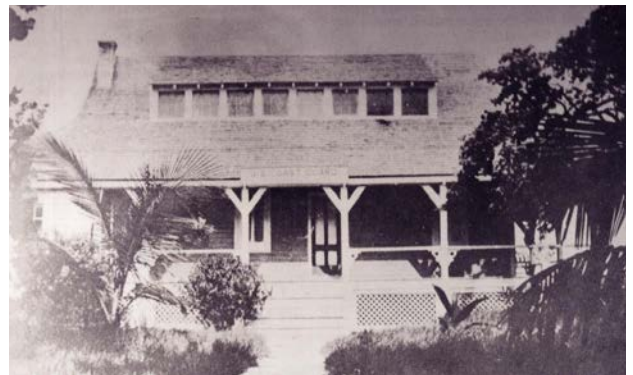
House of Refuge as Coast Guard Base during WW I

Albert Blaisdell of Boston was appointed the architect. The houses were all alike: frame construction, one-story with loft. Three main rooms downstairs surrounded by an eight-foot-wide verandah on three sides and a narrow kitchen on the north side, windows with screens and shutters but no glass, and a brick chimney in the kitchen for a cook stove. The keeper and his family lived downstairs; the loft, with a small window on each end was equipped with approximately 20 cots for castaways and visitors. Many sailors used to sleeping on the ship's deck did not want to spend the night in the cramped second floor and would sleep out on the porch overlooking the water. There was an outhouse, a boathouse for the lifeboat and a large wooden elevated tank which held