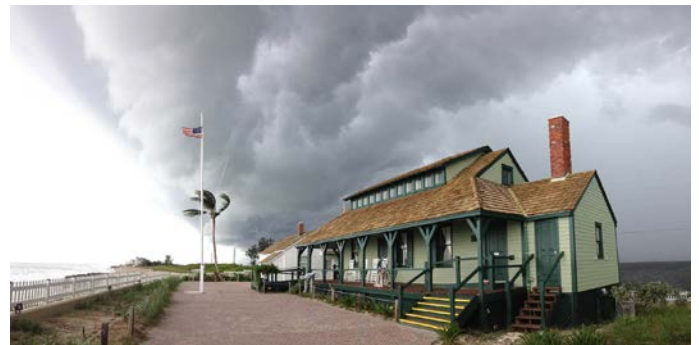
House of Refuge at Gilbert's Bar

Today there is a House of Refuge museum located in Stuart, Florida which can be visited year-round. The House of Refuge at Gilbert's Bar is the only remaining House of Refuge. Built as one of ten along the east coast of Florida, it is the oldest structure in