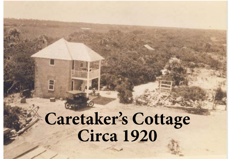
Caretaker's Cottage Circa 1920

Bonnet House was fortunate to secure a Special Category grant from the State of Florida which has allowed us to complete a number of restorations. One of the buildings being restored back to its original 1920's appearance is the Caretaker's Cottage. Like any other building that is almost 100 years old, various repair needs were discovered. The posts that hold up the upstairs porch needed to be replaced. The foundation footer on the first floor had to be replaced. The porch floor was rotted and will be replaced. All custom milled spindles had to be replaced on the railings and some siding that has been installed over the years was removed. The project should be completed by October.