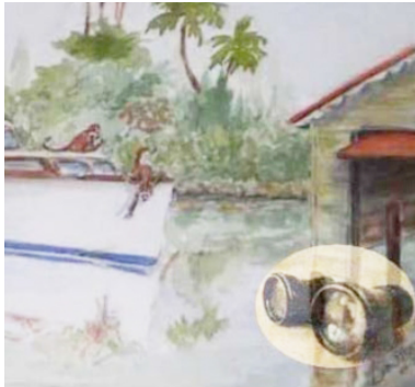
Mitchell's Magical Day at Historic Bonnet House