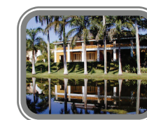
Bonnet House and Stranahan House

Explore two South Florida historic homes.