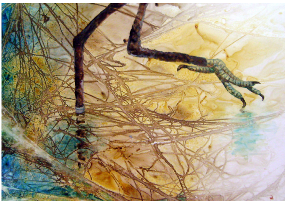
Tammy Seymour, Step On It , Watercolor