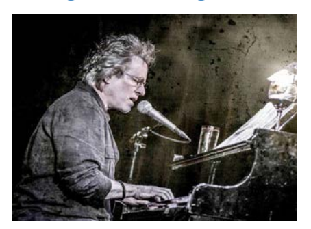
November 6, 2014 7:00 pm MULTI PLATINUM NOMINEE STEVE DORFF PERFORMS Purchase tickets at bonnethouse.org