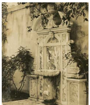
The fountain in Palm Beach

One of the features of the Bonnet House estate designed by Frederic Bartlett is a decorative area with a non-functioning (hence "dry") stone fountain located on the crest of the Secondary Dune. According to Evelyn Fortune Bartlett, Frederic purchased the center portion when a mansion in Palm Beach was being torn down.