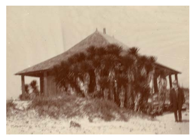
Hugh Taylor Birch Standing by the House of Refuge, c. 1902

In 1876, the US Government extended the welcome arm of the U.S. Life-Saving Service down the long deserted southeast coast of Florida. Five stations called Houses of Refuge or Life Saving Stations were built approximately 25 miles apart. Construction of House Number Four in Fort Lauderdale was completed on April 24, 1876 and was situated near what is today Bonnet House Museum & Gardens. Its location was on the main dune of the barrier island that is approximately four miles north of the New River Inlet. Archeological finds from that time have been discovered in the area and an old wellhead still exists at this location.