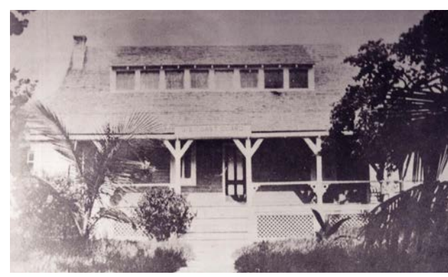
House of Refuge as Coast Guard Base during WW I

Albert Blaisdell of Boston was appointed the architect. The houses were all alike: frame construction, one-story with loft. Three main rooms downstairs surrounded by an eight-foot-wide verandah on three sides and a narrow kitchen on the north side, windows with screens and shutters but no glass, and a brick chimney in the kitchen for a cook stove. The keeper and his family lived downstairs; the loft, with a small window on each end was equipped with approximately 20 cots for castaways and visitors. Many sailors used to sleeping on the ship's deck did not want to spend the night in the cramped second floor and would sleep out on the porch overlooking the water. There was an outhouse, a boathouse for the lifeboat and a large wooden elevated tank which held