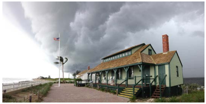
House of Refuge at Gilbert's Bar

Today there is a House of Refuge museum located in Stuart, Florida which can be visited year-round. The House of Refuge at Gilbert's Bar is the only remaining House of Refuge. Built as one of ten along the east coast of Florida, it is the oldest structure in