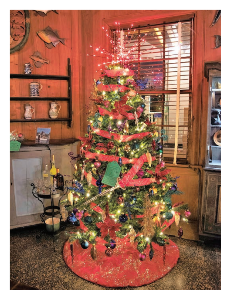
Holiday Magic, but the opening of a year-long celebration of Bonnet House's centennial.

Much like the wedding, their 100th anniversary will be celebrated quietly too. However, it will set in motion preparation for something far from quiet, namely the 100th anniversary of Bonnet House in 2020. Not much in South Florida can lay claim to a 100-year heritage. This remarkable property has an equally remarkable story, and we will be working behind the scenes to make a real splash when December rolls around again to celebrate not only the third year of