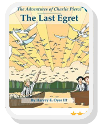
The Last Egret By Harvey E. Oyer III Journal Field Trip Guide

Cost: $8.00 per student Program Length: 2 hours