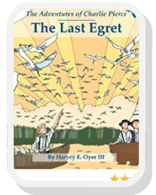
The Last Egret By Harvey E. Oyer III Journal Field Trip Guide

Program Length: 4 hours (including 30 minute lunch break)